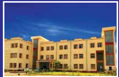
The ICFAI University, Raipur