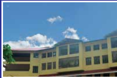
The ICFAI University, Meghalaya