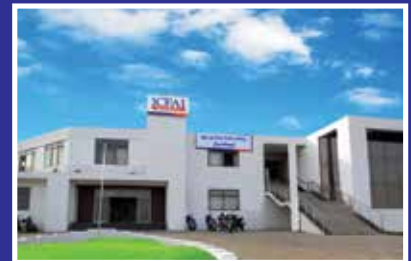
The ICFAI University, Jharkhand