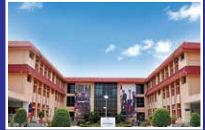
The ICFAI University, Dehradun