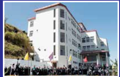
The ICFAI University, Mizoram