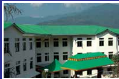
The ICFAI University, Sikkim