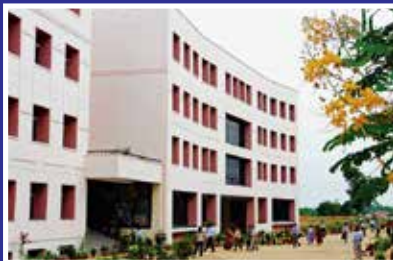
The ICFAI University, Tripura