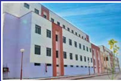
The ICFAI University, Himachal Pradesh (Baddi)