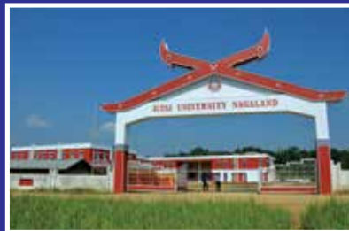
The ICFAI University, Nagaland