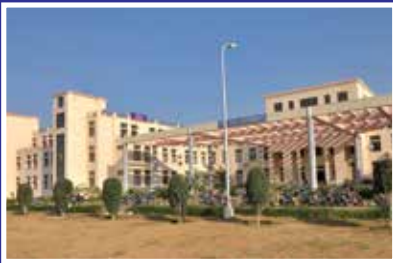
The ICFAI University, Jaipur